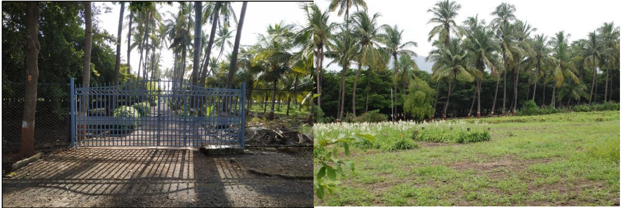
Research and Experiment farm, Jambuvadi