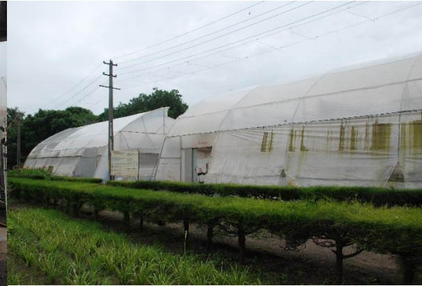
Natural ventilated and Fan Pad type Unit