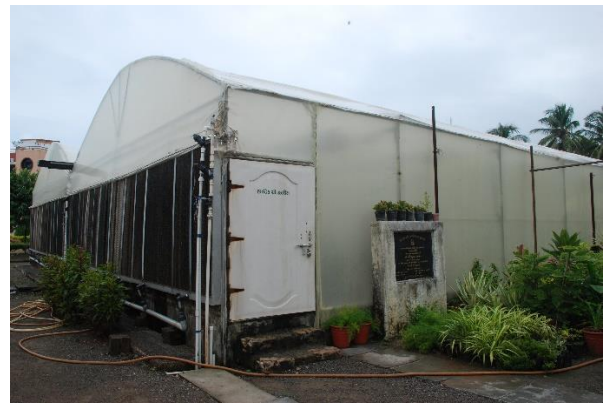
High Tech Protected Unit