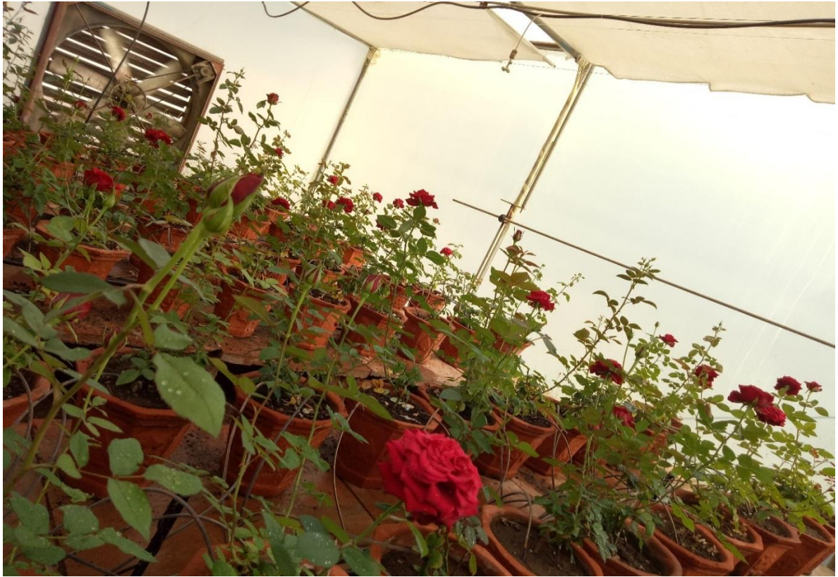
Rose experiment in Protected Structure