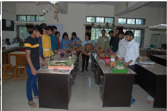
Flower Craft Preparations