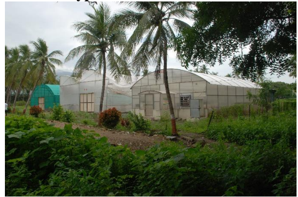
Shade Net House, Natural ventilated and Fan Pad type Unit