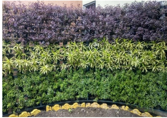
Rosary and Green Wall STUDENT'S CORNER